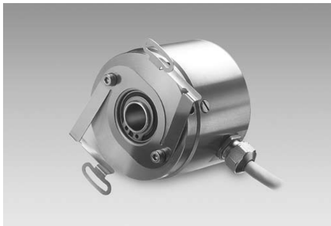
GE333 with hollow shaft